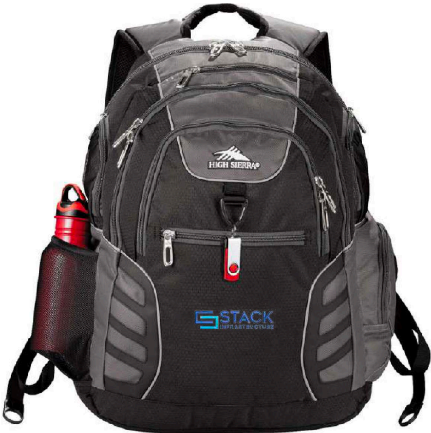
EMB SIZE : H22.7mm x W100.4mm