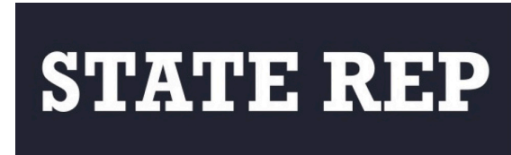
Size: W55.0mm x H7.4mm