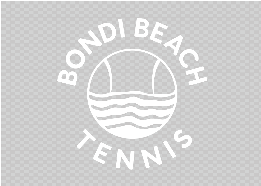
This is a guide, artwork may not be to scale. Please refer to the specified size for final print dimensions.