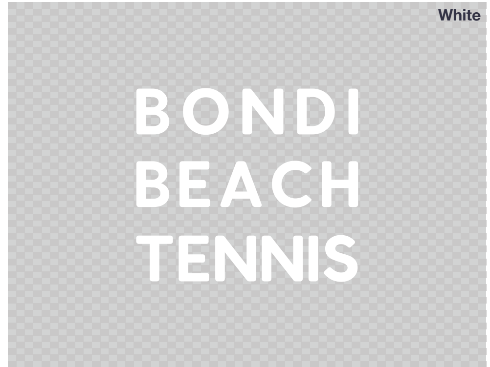
This is a guide, artwork may not be to scale. Please refer to the specified size for final print dimensions.