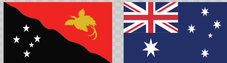
PNG 50th Independence Anniversary

This is a guide, artwork may not be to scale. Please refer to the specified size for final print dimensions.